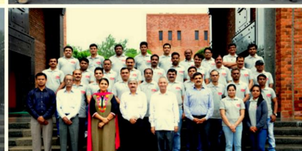
Dinshaw's Dairy Food Limited, August 7, 2015