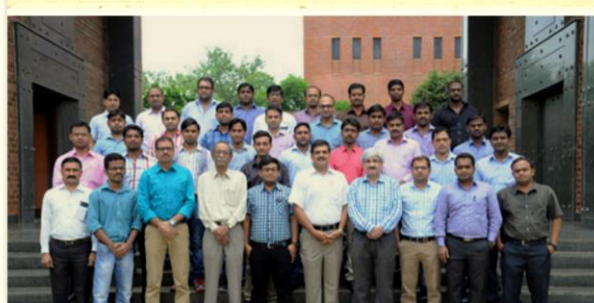
Asian Paints Limited, 13 - 18, July, 2015