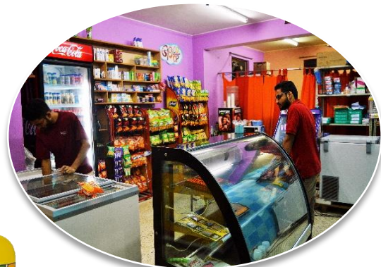
7 Student ventures on campus.