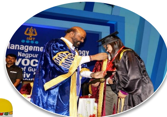
11 Endings create new beginnings.