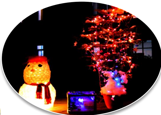
9 Celebrating moments of joy.